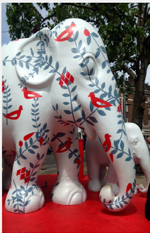
This 10ft high model of an elephant, symbolising Tara, was also auctioned for £42,000

of the wild Asian elephant – there are only 35,000, down 90% over the past 100 years.